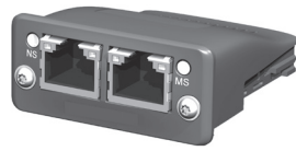
Active - (Industrial Ethernet)